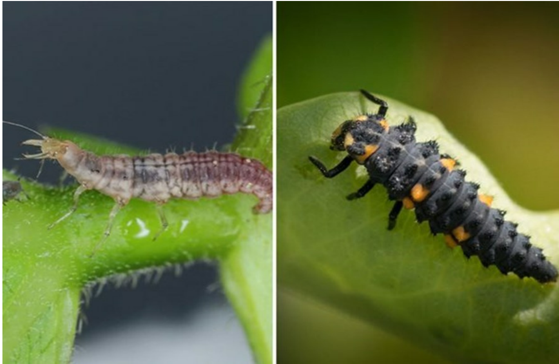
Pictured Left: Green lacewing larva.